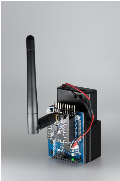
Fig. 3. Battery-powered InPhase sensor node (reproduced from [5]).